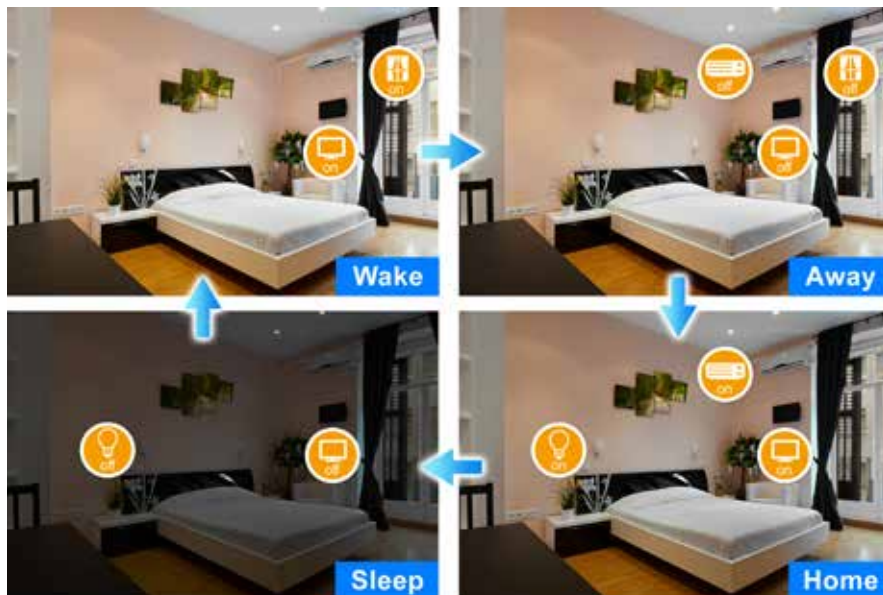
Multiple Scene Modes For Smart Home

In the "Scene" mode you can set everything you want in every room of your home for any activity or anything in-between from morning to night. An unlimited number of scenes can be created and customized to your personal preferences.