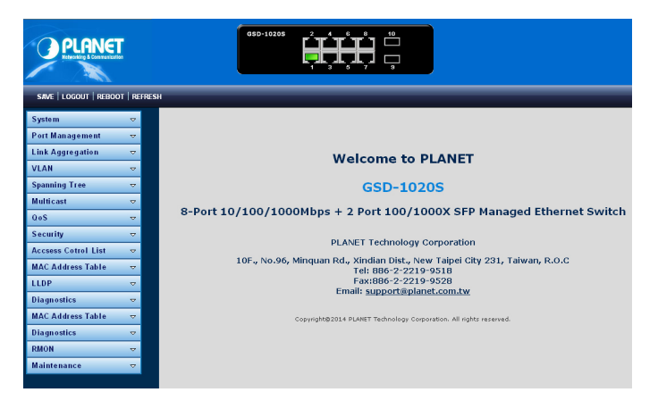
Figure 3-3: Web Main Screen of Managed Switch

3. After entering the password, the main screen appears as Figure 3-3 shows.