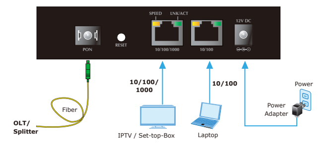
Figure 3-1: EPN-103 connection diagram