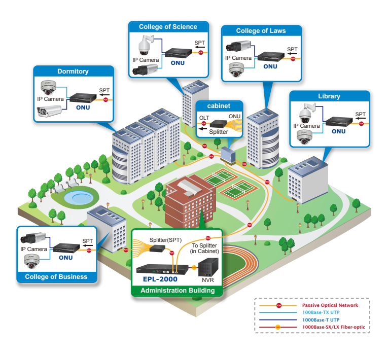
Figure 3-2 IP Surveillance System Application