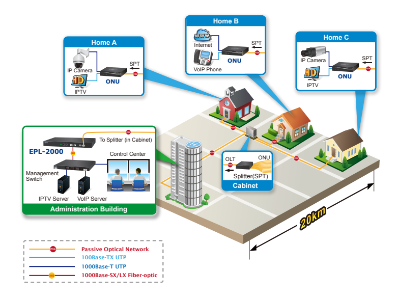
Figure 3-3 Fiber to the House Application