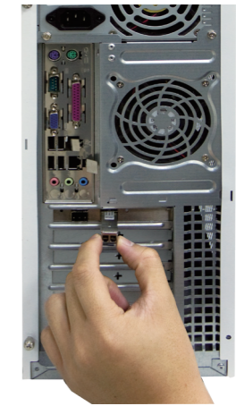
Figure 1: Insert the 10GBase-LR / SR mini-GBIC module into ENW-9800