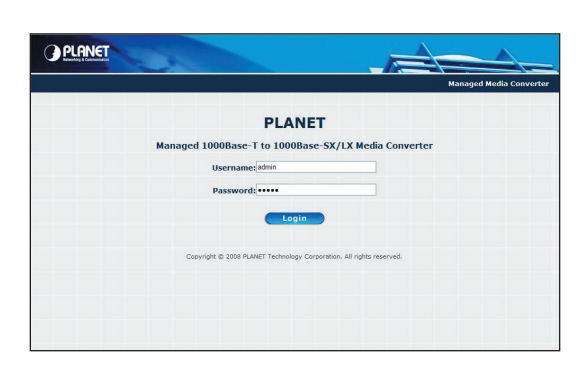
Figure 1. Web Login Screen of Managed Media Converter

The Web main screen appears as in Figure 2 after the login.