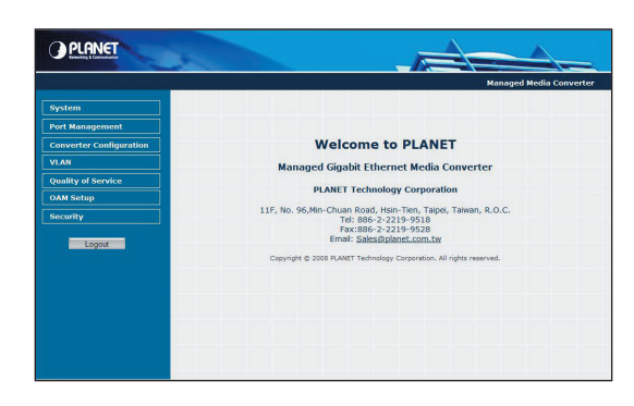
Figure 2. Web Main Screen of Managed Media Converter

The Web main screen appears as in Figure 2 after the login.