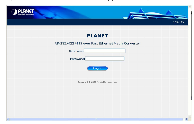
Figure 2-1: Web Login Screen of ICS-10X

After entering the username and password (default user name and password is admin), the login screen appears as Figure 2-1 and the main screen appears as Figure 2-2.