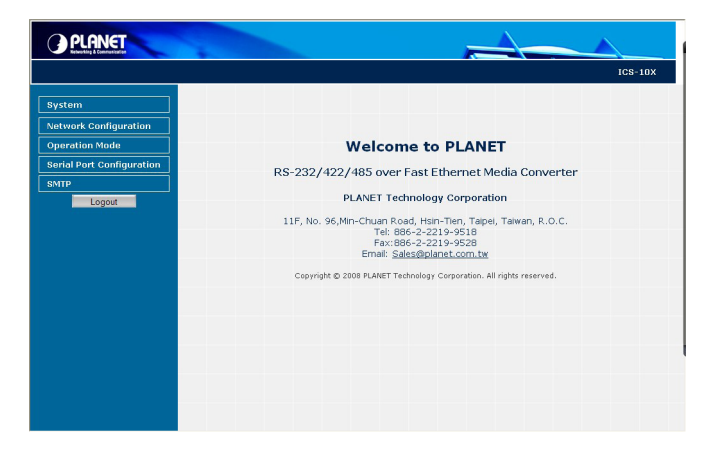
Figure 2-2: Web Main Screen of ICS-10X

Now, you can use the Web management interface to continue the ICS-10x management. Please refer to the user manual for more.