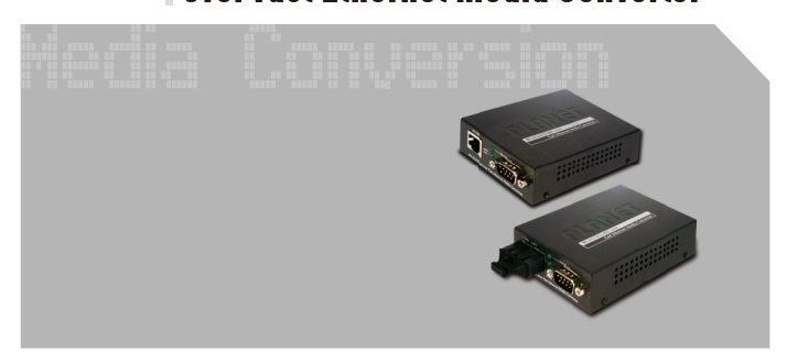
Quick Installation Guide

Serial RS-232/RS-422/RS-485 ICS-10X Over Fast Ethernet Media Converter